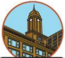
Damon City Campus