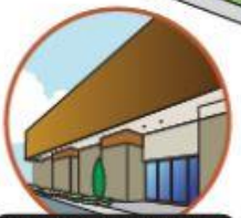
Applied Technologies Center